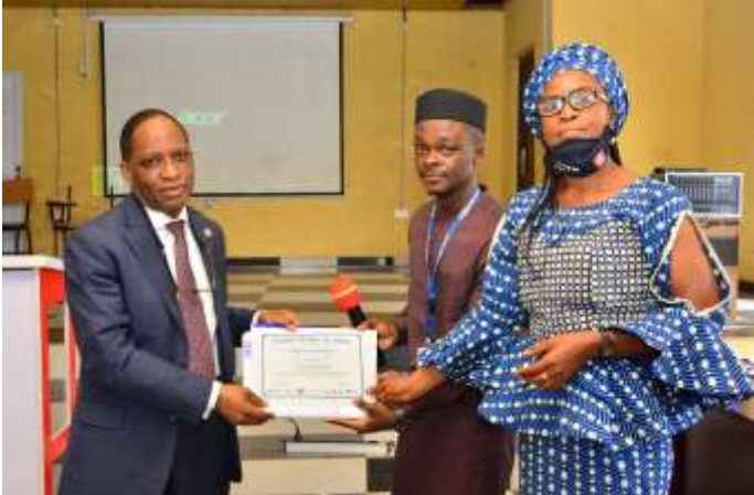
DBI ADAPTI Coordinator presenting participants certificate to the VC UNIMED