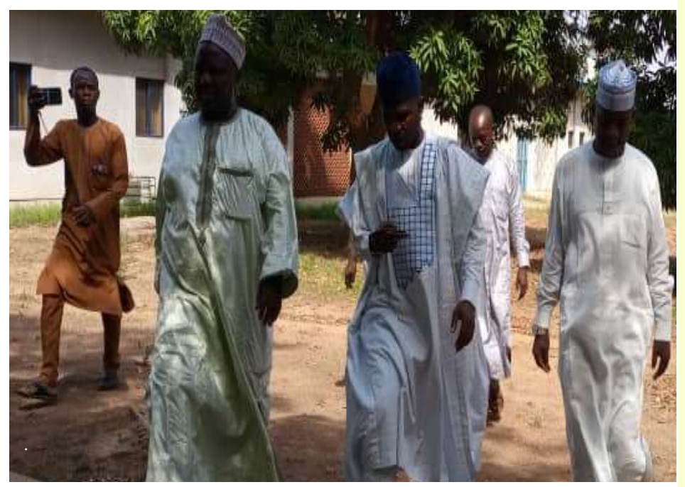
The head of DBI Kano (R) giving the Chairman a tour of Institute.