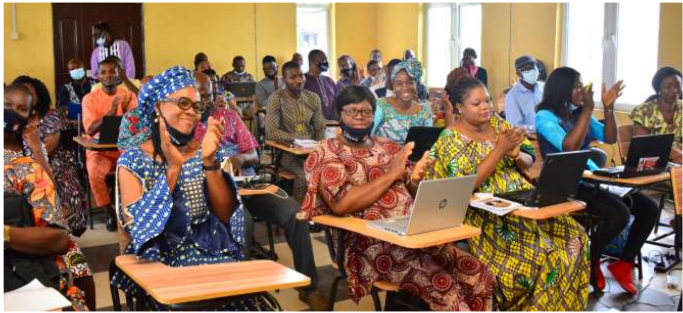
ADAPTI Participants at the closing ceremony