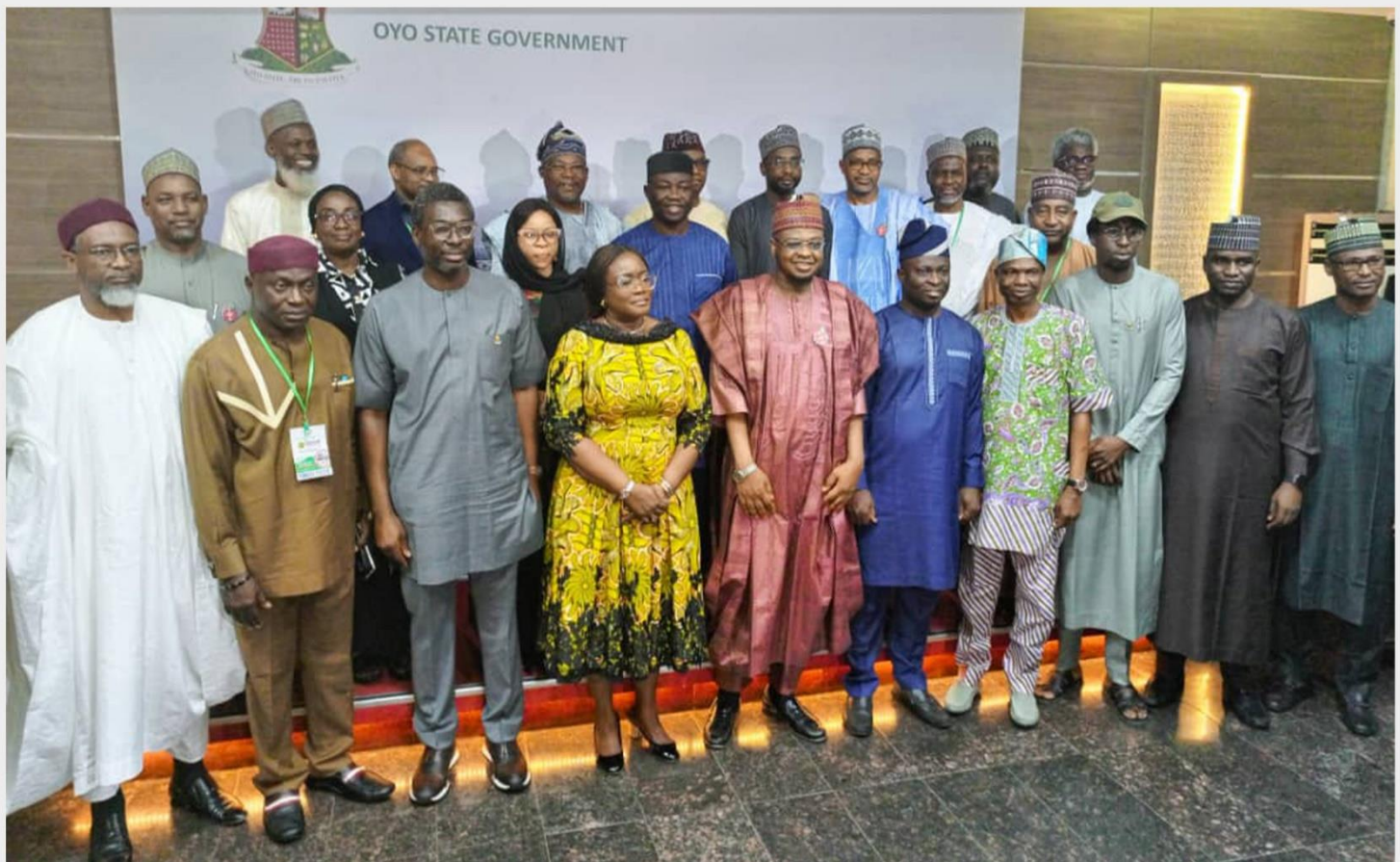
Group photography of council members and the Honourable Minister of Communications and Digital Economy, Prof. Isa Ali Ibrahim Pantami at the office of the Governor, Oyo State.