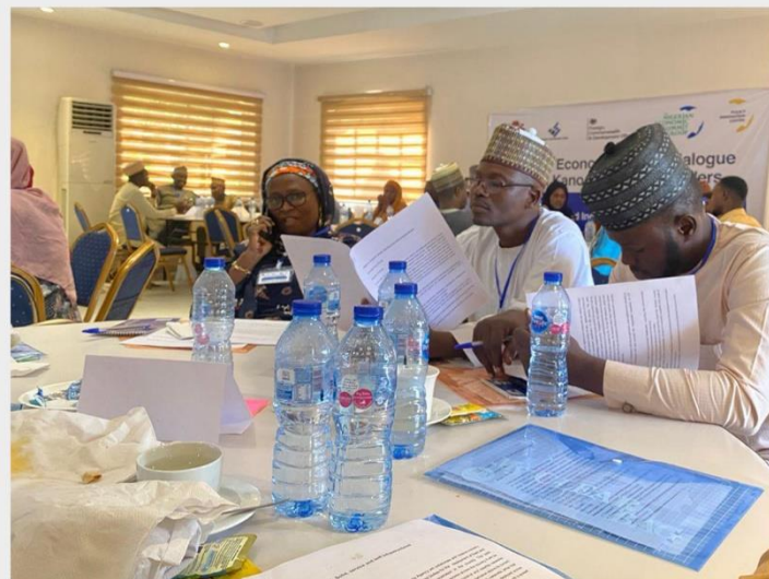
Participants at the stakeholders dialogue

The DAP, as the FCDO stated, also seeks to build up-to-date digital capacity in Nigeria, in partnership with key stakeholders in the public, private, non-profit, and research sectors.