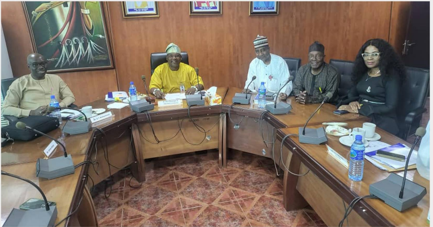
At the DBI 59th Board Meeting held on Tuesday, 20th December, 2022 at the Headquarters, Utako, Abuja