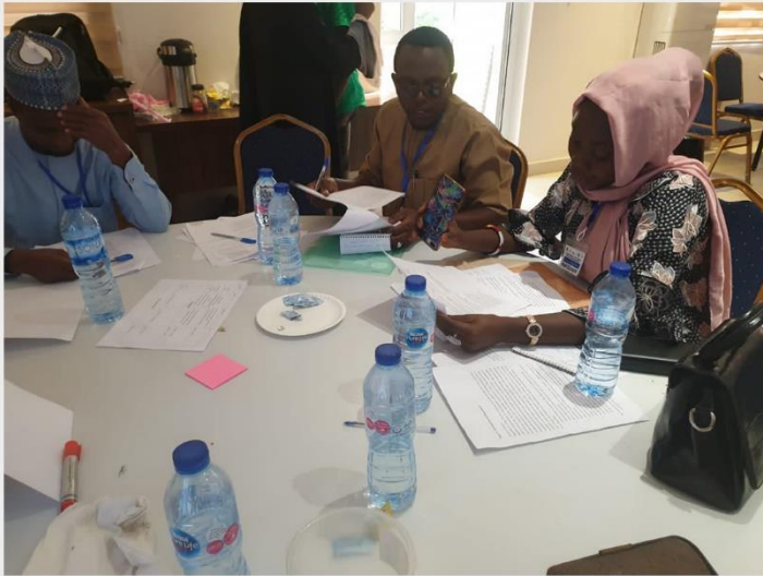
Participants at the stakeholders dialogue

Arriving in 2019, the Digital Access Programme in Nigeria has been understood to be supporting key stakeholders and partners to advance inclusive digital growth and development, build digital skills and increase access to locally-relevant digital content and services, through enhancing the relevant policy and regulatory frameworks, strengthening the capacity of relevant institutions and organizations.