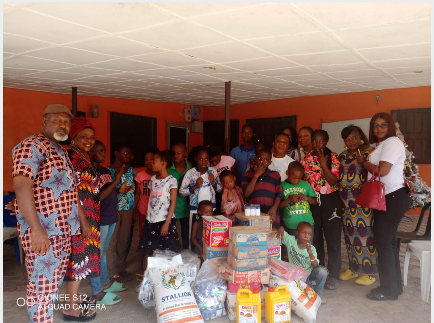
DBI's Fellowship Members at the Orphanage home during their visitation