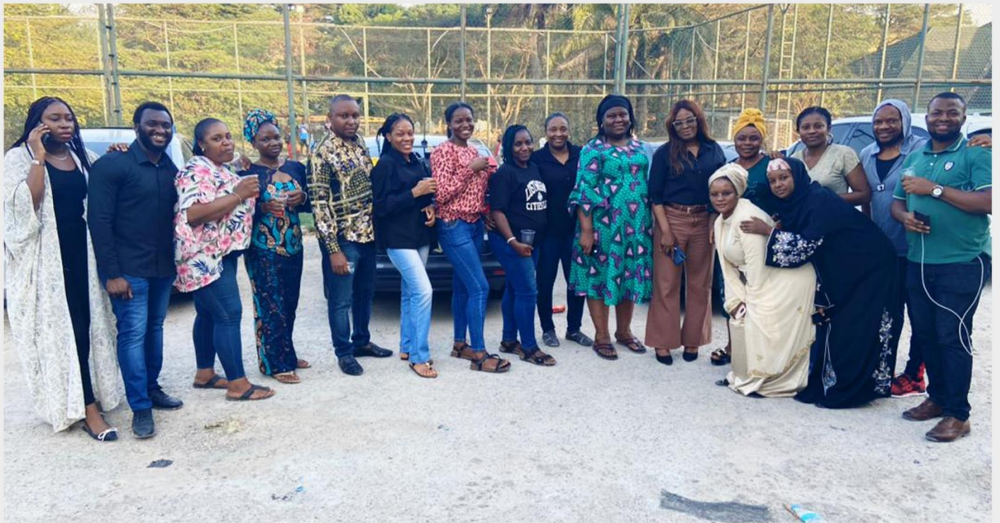
Group photograph of Staff present at the match